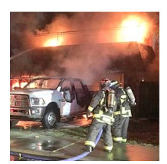
Five Cities Fire Authority may phase out reserve firefighter program