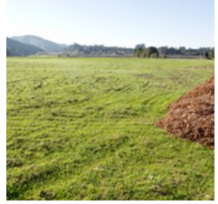
Los Osos is pushing its recycled water to schools, parks, and farmers